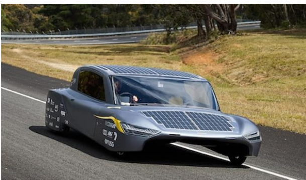
Sunswift 7 – front view