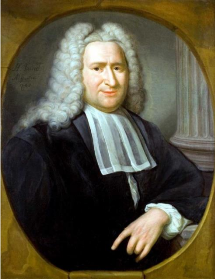
Pieter van Musschenbroek

“I’ve found out so much about electricity that I’ve reached the point where I understand nothing and can explain nothing.”