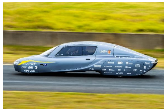
Sunswift 7 – side view