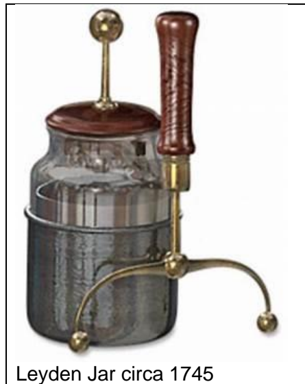
Leyden Jar circa 1745

Not long after Pieter van Musschenbroek (1692-1761) , a physicist, mathematician and professor of medicine from Leiden, Netherlands independently discovered and conducted electrical experiments with his Leyden Jar. Many sources name him as the inventor of the Leyden Jar as he improved the documentation and Jar.