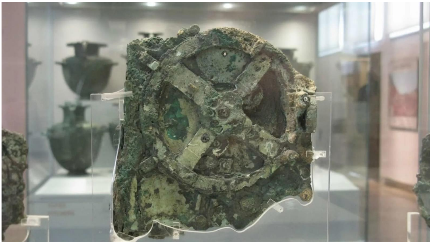
National Archaeological Museum of Greece in Athens features the Antikythera Mechanism.

pointers on the front face of the device have not survived (or are still missing at the bottom of the sea).