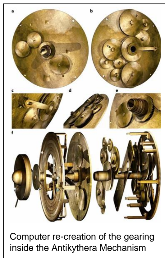
Computer re-creation of the gearing inside the Antikythera Mechanism