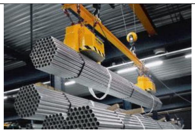
A steel-pipe-lifting-magnet. https://copperalliance.eu