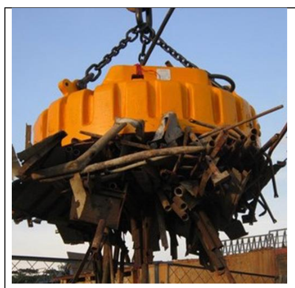
A crane with an electromagnet lifting scrap metal waste.