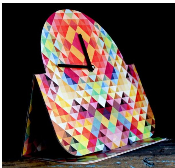
The clock in its table top version.

https://www.behance.net/gallery/Artime/8338267