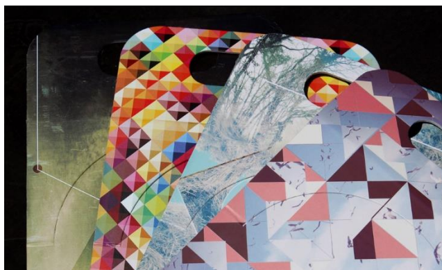
Examples of ARTIME clock designs