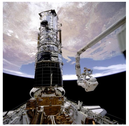
Astronaut F. Story Musgrave, anchored on the end of the Remote Manipulator System arm, prepares to be elevated to the top of the Hubble Space Telescope.

The Hubble can only take images in black and white. The telescope takes a number of pictures of the same object using a variety of filters. These images show different parts of the colour spectrum. The resultant images are combined for a full-colour composite.