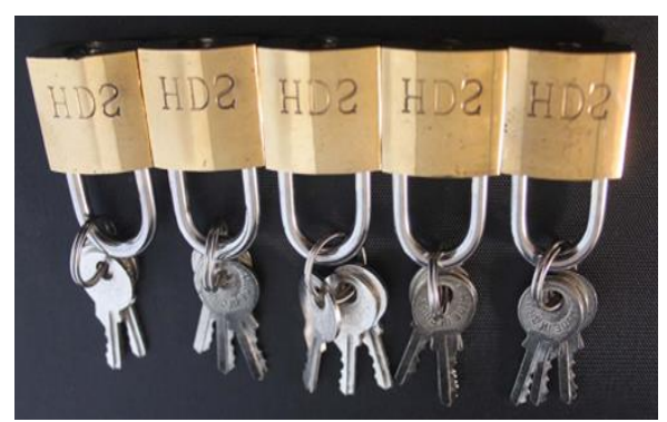
25mm body, 3 keys per padlock

4.0mm Shackle (Code: PLL-25) – Pack of 25, Was $17.50 Now $8.75 https://www.scorpiotechnology.com.au/tools