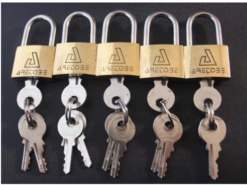
20mm body. 3 keys per padlock

Wire Cable (Plastic coated) (Code: CA2-10) 7 x 7 strand, stainless steel rope, 2mm dia, 10m. Was $3.75 Now $1.87